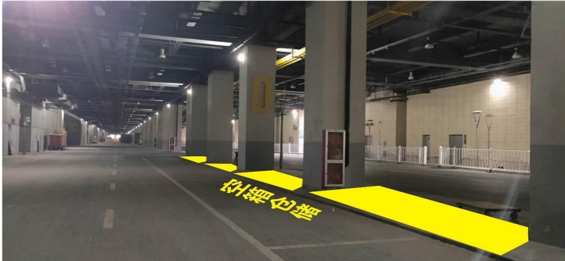
Third-floor storage area (truck lane, between pillars):